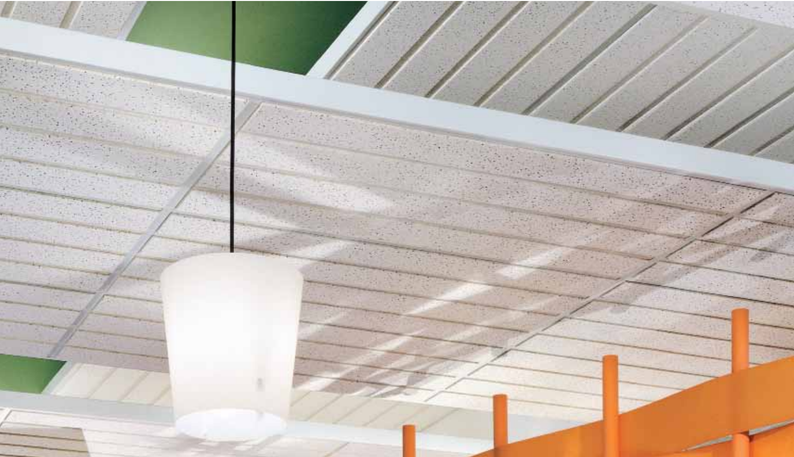
RADAR Illusion Four/48 Panels with CLIMAPLUS Superior Performance/ DONN DX/DXL Suspension System

Year Availability 2842, 2852, 2862, 2882