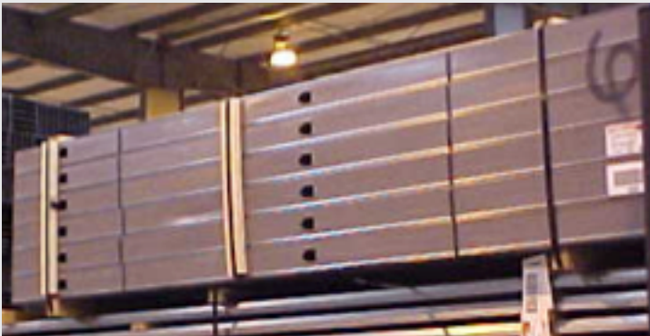
Figure 1: Skid of Nonstructural Framing

ProSTUD Drywall Framing with DiamondPlus Coating is packaged and shipped in skids. Products are generally nested together in pairs, then stacked with other sets of nested pairs and are held together using banding and wood dunnage (See Figure 1).